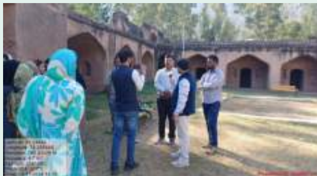
At Chingus Sarai