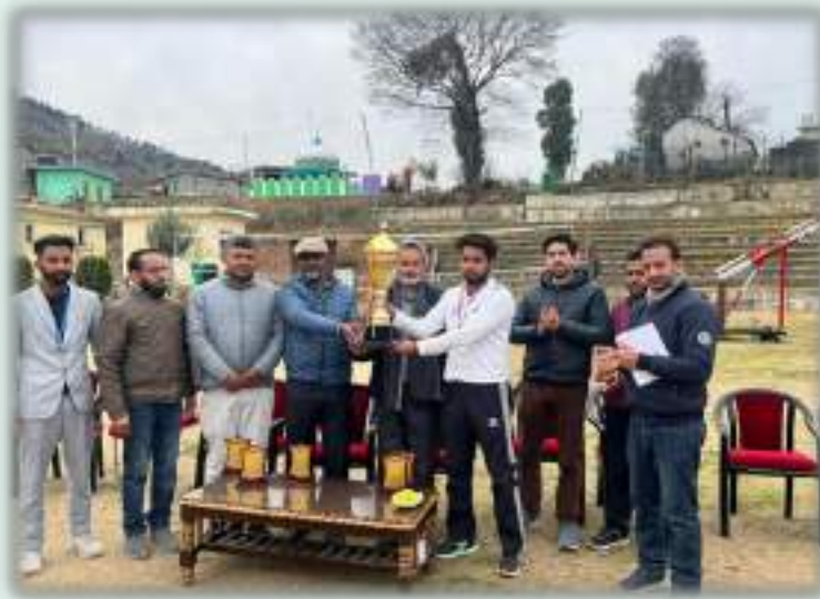
Cricket tournament 2024