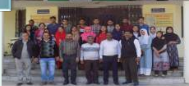
RSRS Miran Sahib, Jammu