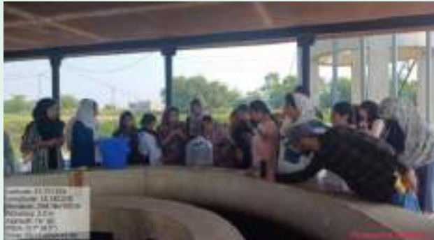
Chinese circular fish hatchery