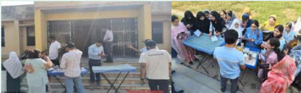
Students learning the rearing technique by using various appliances