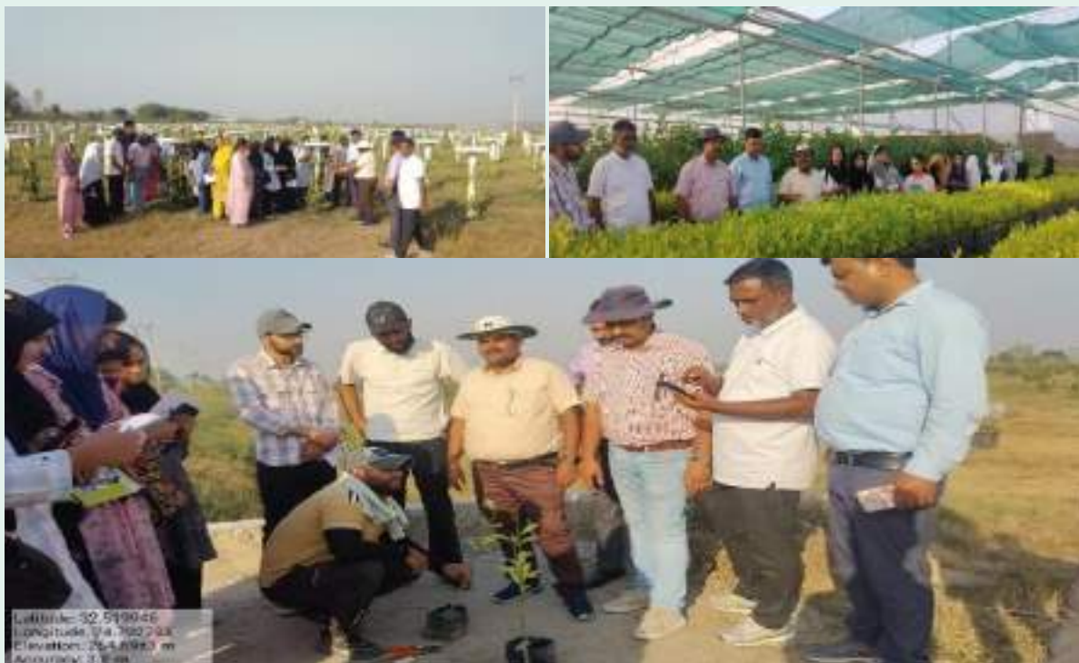
Mega Fruit Plant Nursery, Chakroi, R.S. Pura learning Nursery and gardening