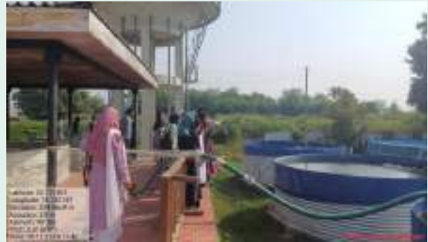
Bio floc fish farming