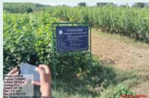
Students visiting mulberry garden in RSRM Miran Sahib