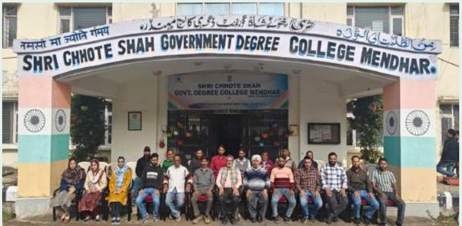
Principal with Non-teaching staff