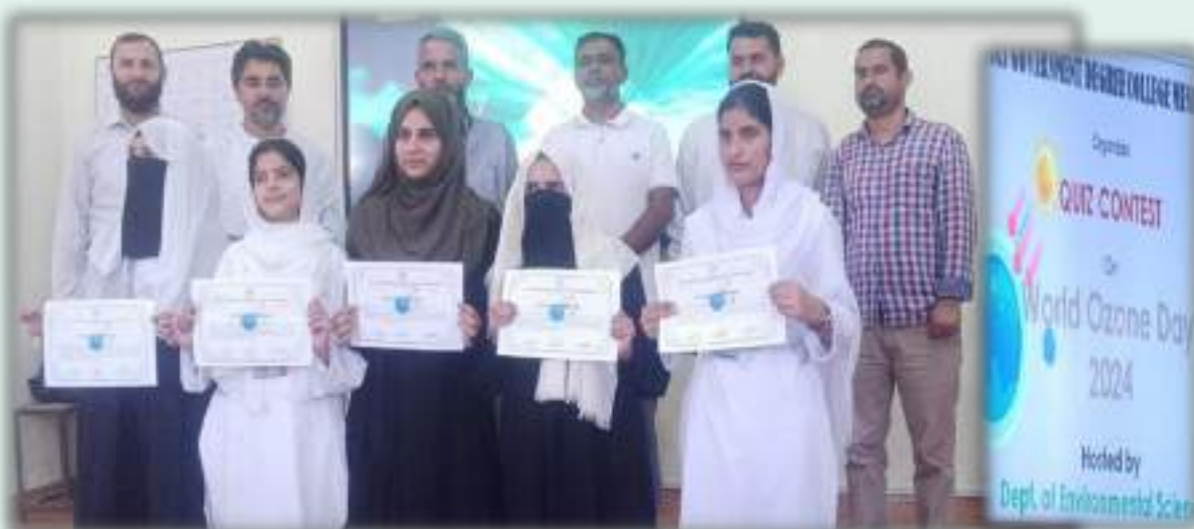
Participants of a Quiz on Ozone Day, 2024