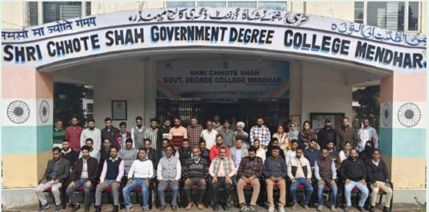
Worthy Principal and staff of the college