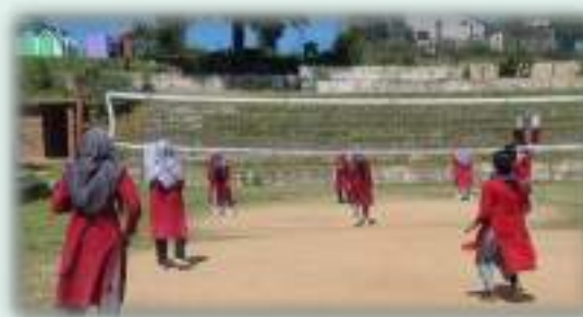
Girls Volley ball match