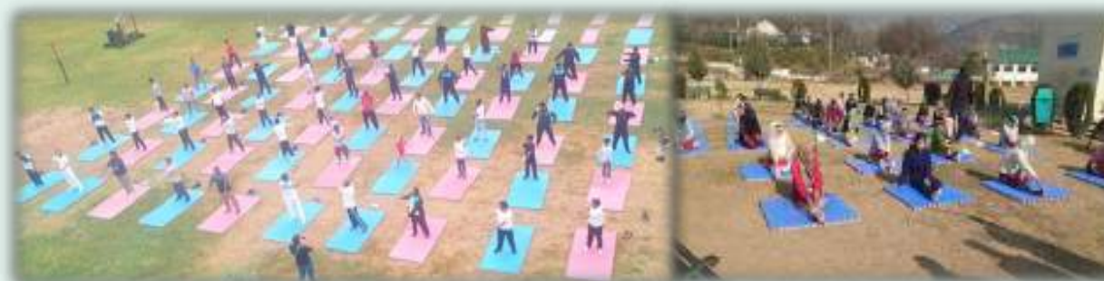
Yoga Day2024celebrations in the college campus