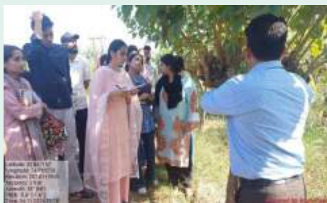
Students posing for group photo at RSRM Miran Sahib