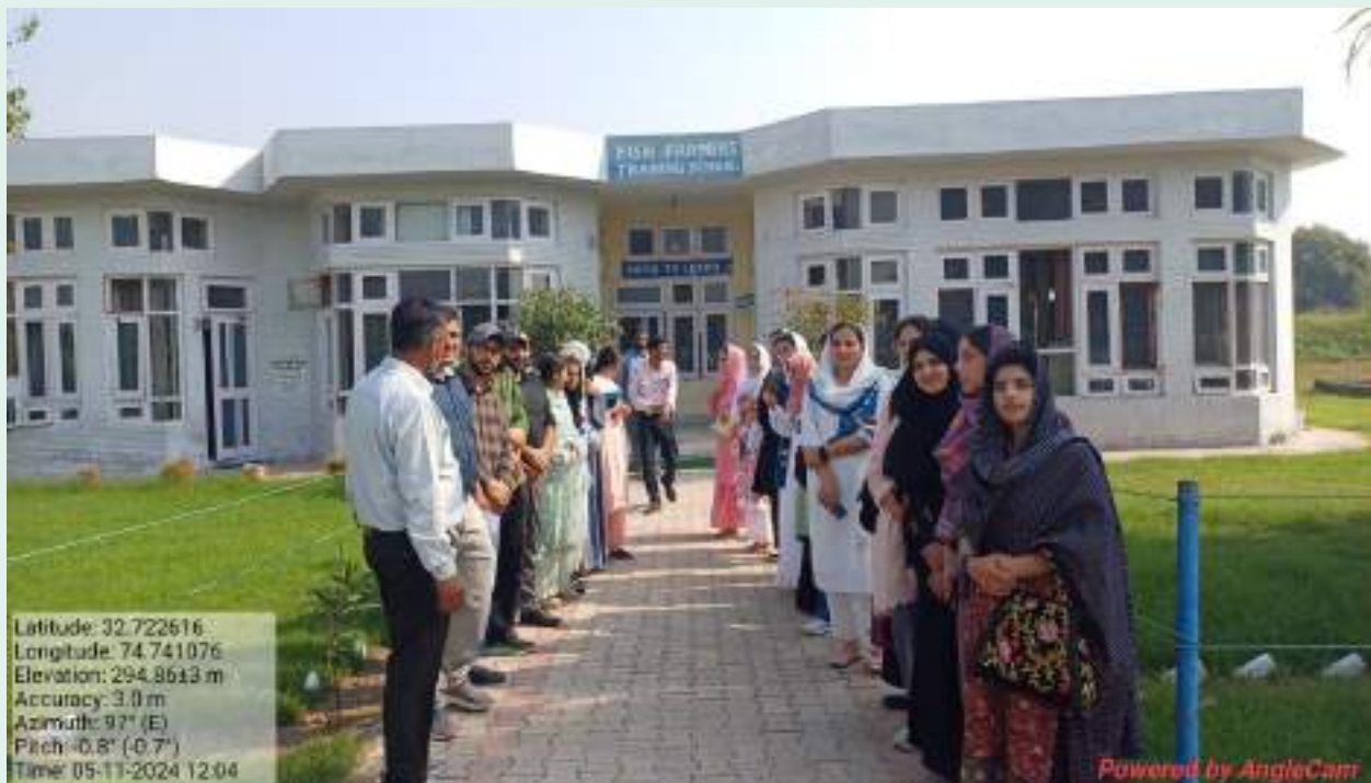
Posing for group photograph at Ghoumanasa fish farm