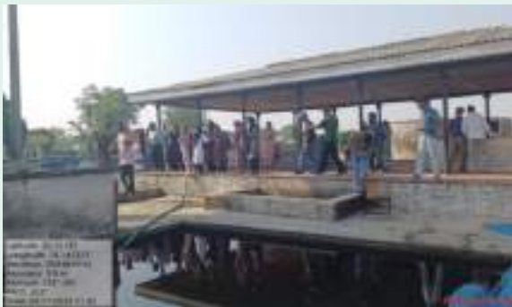
Ponds for fry stages