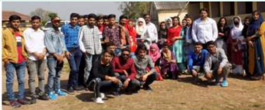
Animal Husbandry and Poultry Farm Belecharana, Jammu