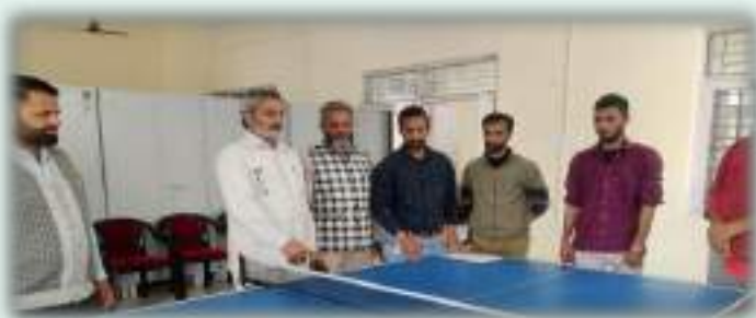
Table Tennis match