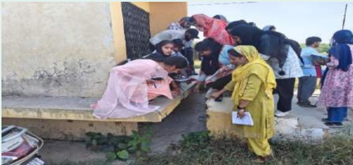
Student pointing the rat proof structure of rearing room